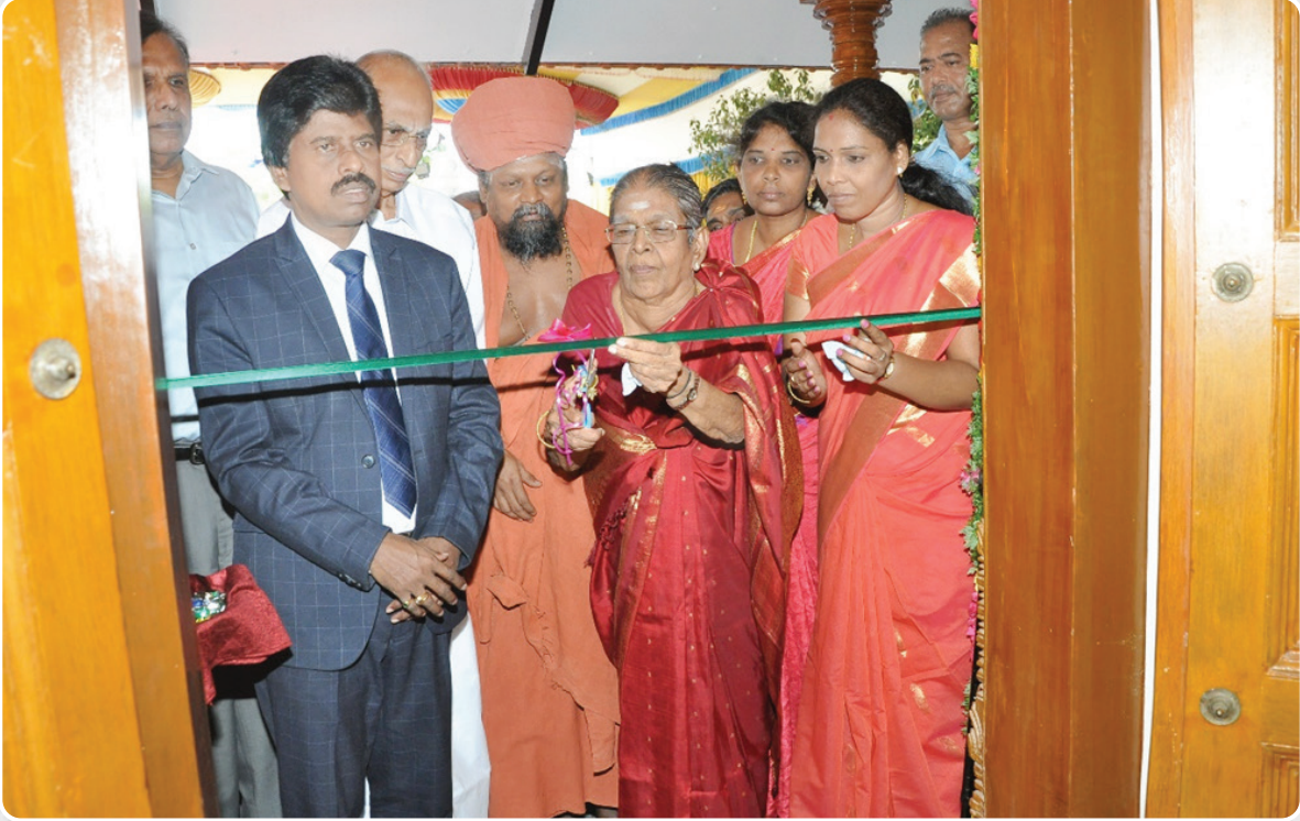
Dignitaries at the Inauguration of Vallal Dr. Alagappan Museum